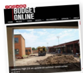
LHSBUDGET.COM NEWS WEBSITE